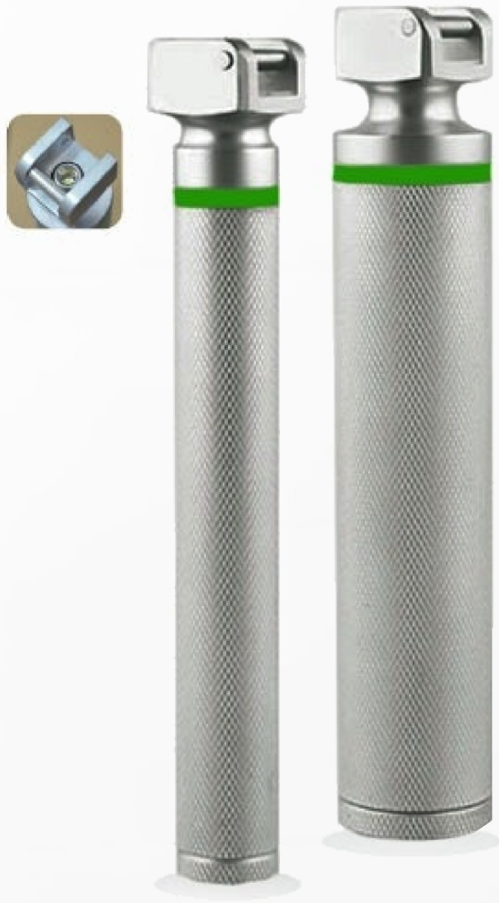
Handles Fiber Optic Illumination