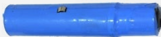
DC LI-ION BATTERY

For Big Handle 4.0 V Can Only Charge With Desk Charger