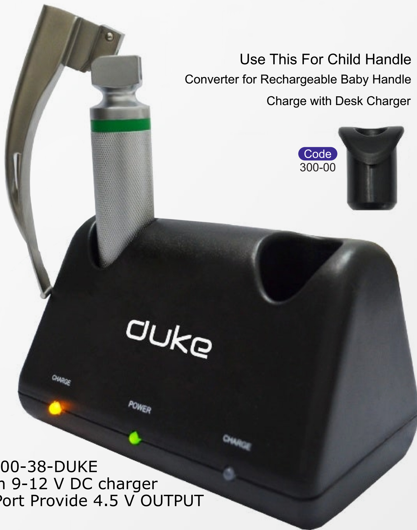
300-38-DUKE With 9-12 V DC charger Every Port Provide 4.5 V OUTPUT

Use This For Child Handle Converter for Rechargeable Baby Handle Charge with Desk Charger