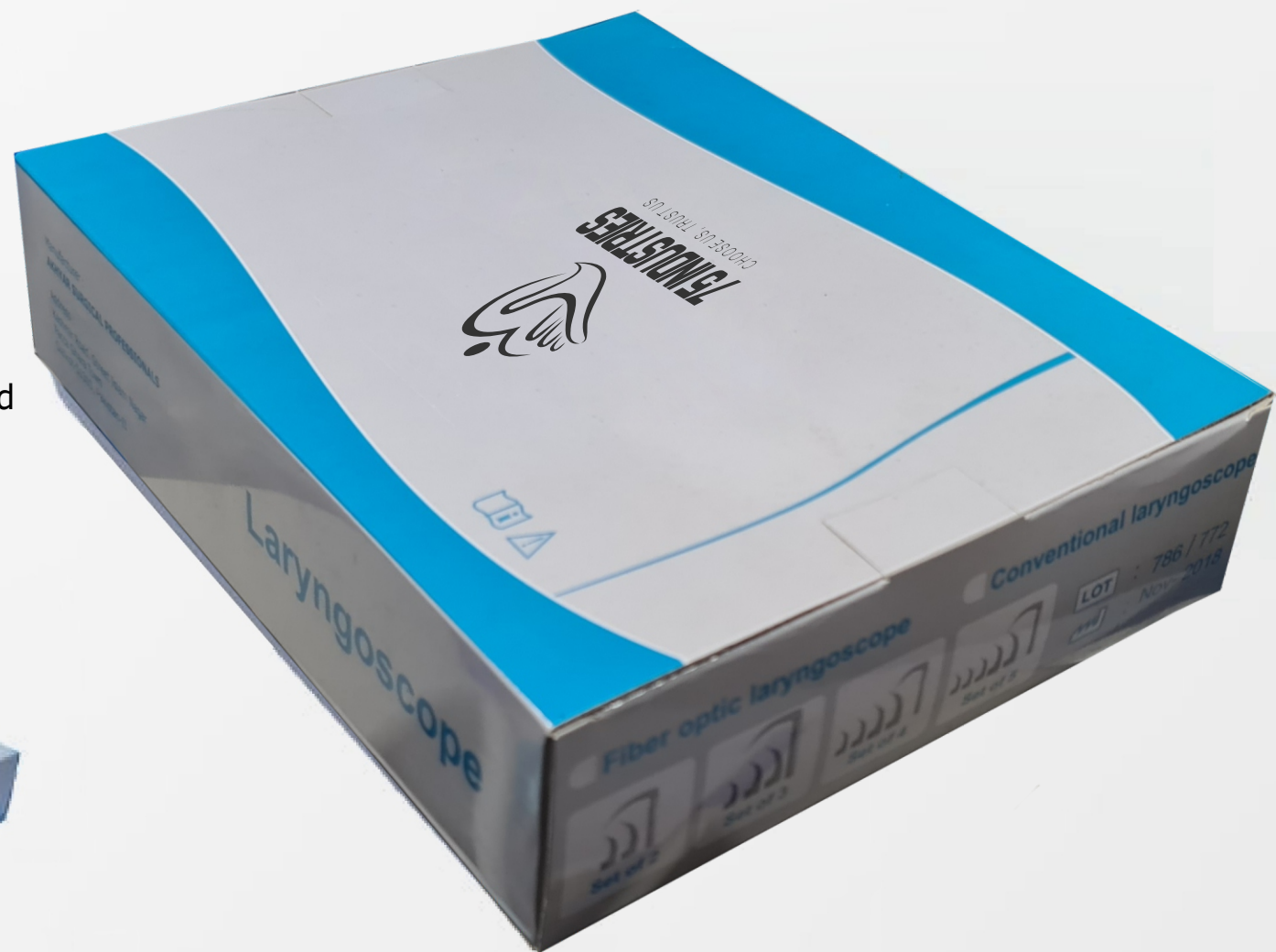
Box.Packing For All kinds of MAC, Miller and Diagnostic Sets In 110-67 Plastic box